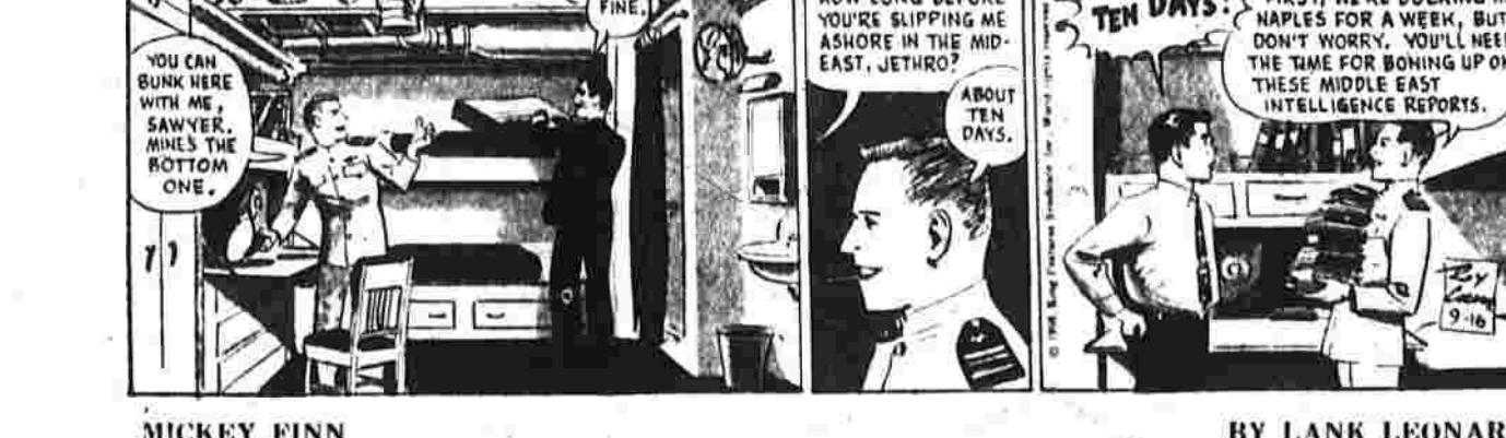
HUZY SAWYER BY ROY CRANE