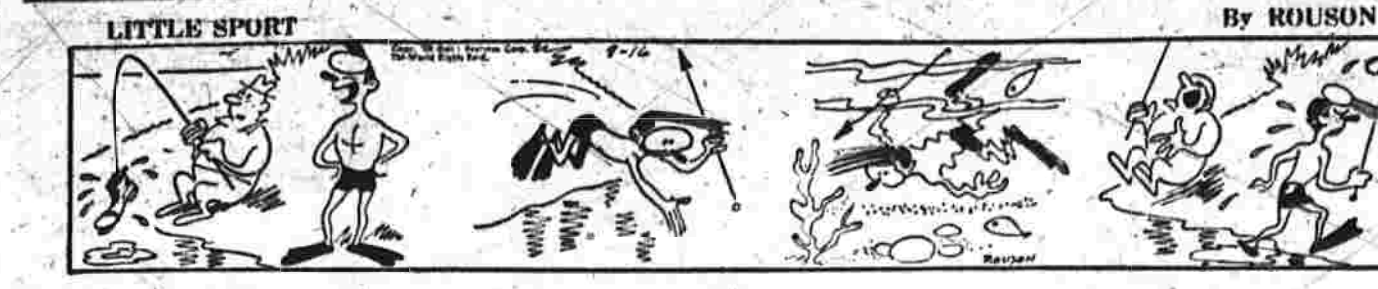
LITTLE SPORT BY ROUSON